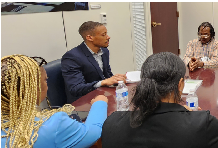
YHC Commissioners speaking with U.S. Senator Gary Peters staffer.