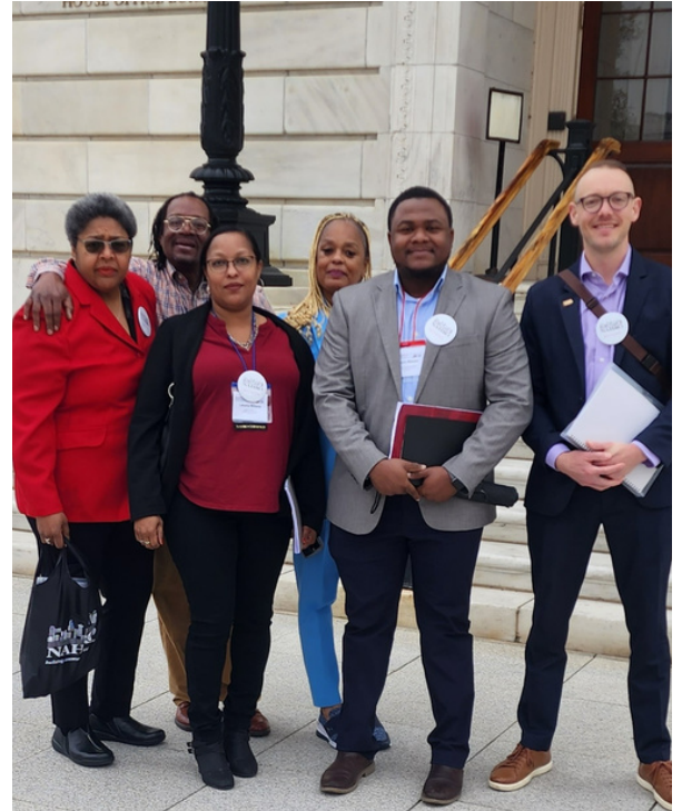
The Ypsilanti Housing Commission Board of Commissioners and YHC staff at Capitol Hill.

The YHC took full advantage of this opportunity as we met with the offices of U.S. Representative Debbie Dingell, U.S. Senator Debbie Stabenow, and U.S. Senator Gary Peters. Not only did we discuss the support we need on a national level, but we discussed issues that are directly tied to YHC communities. We advocated for resources that would allow FEP to provide additional supportive services to our residents, and we also asked for support in the YHCs efforts at combating community violence.