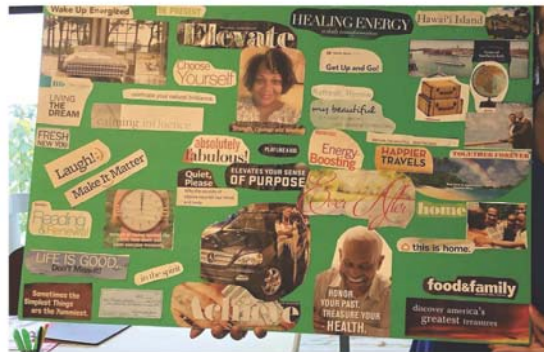
Sample Vision Board

Please bring a 5X7 (or smaller) photo of yourself